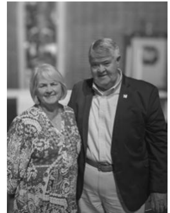
The Webber Family