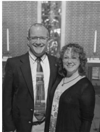
The Boozer Family