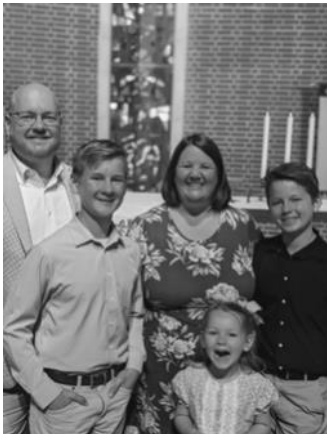
The Boozer Family